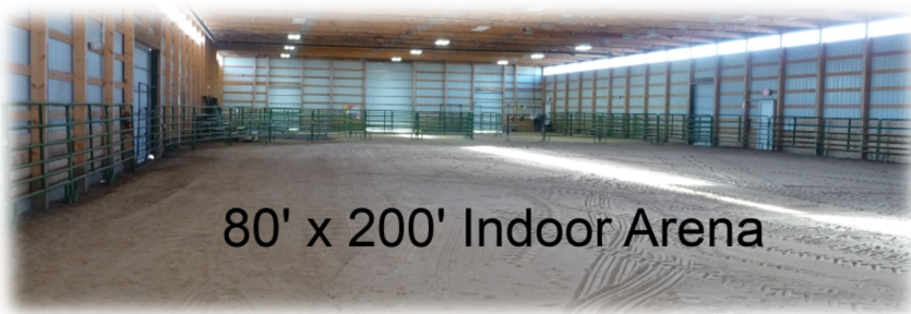
80' x 200' Indoor Arena