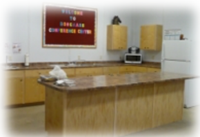
Bomgaars Conference Center 32' x 60'